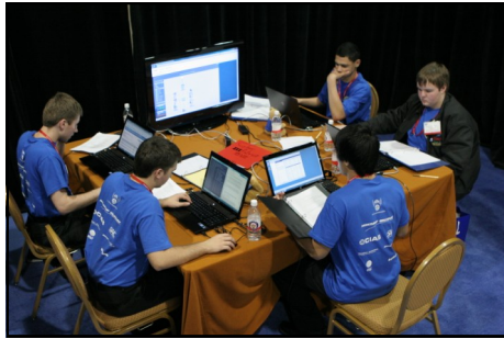
CyberPatriot III Competitors working on images.