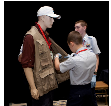
CyberPatriot IV Digital Forensics Event challenges Competitors.