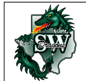
Southwest High School Logo

with equipment, mentors, and internship opportunities. This is a great partnership of exceptional value for the students and the community!